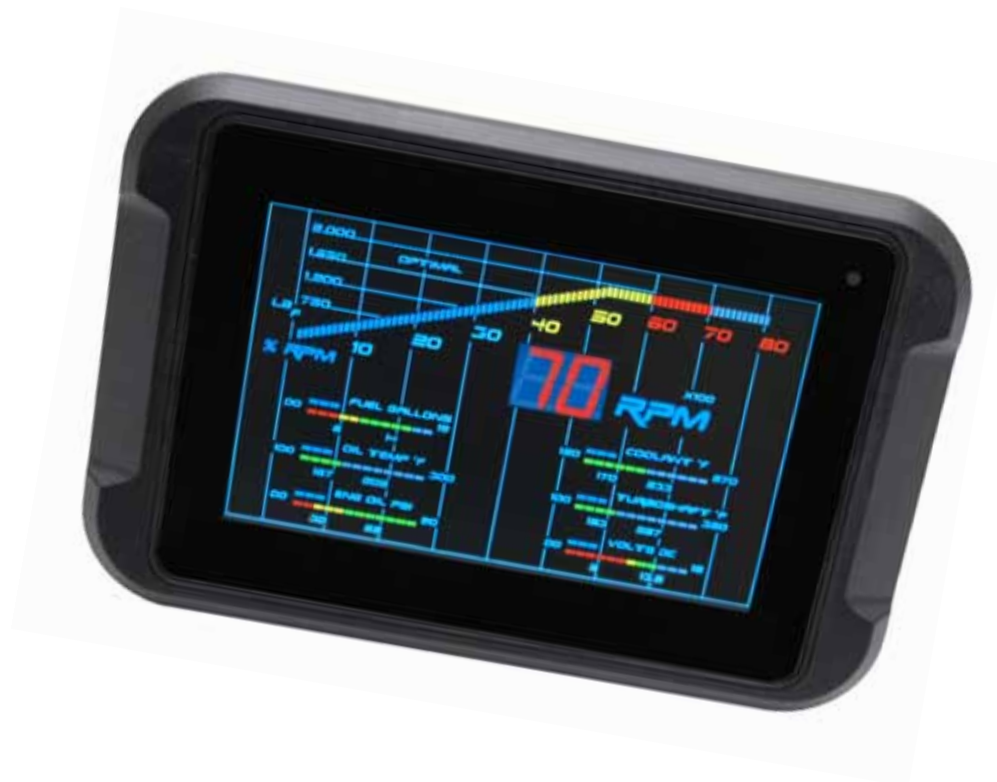
-shown with optional basic bezel